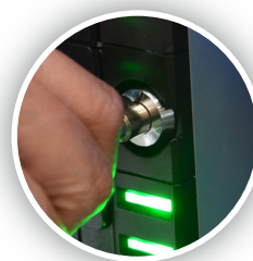
Internal access blocks to cash