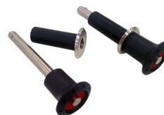
Removable anchor system (optional)